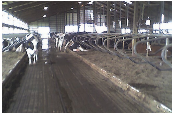
Cows on bedding solids from a Model E

The discharged solids, void of free water and in a compressed moist state (35-40% solids), can be stored for a long term without odor or attracting flies and other pests.